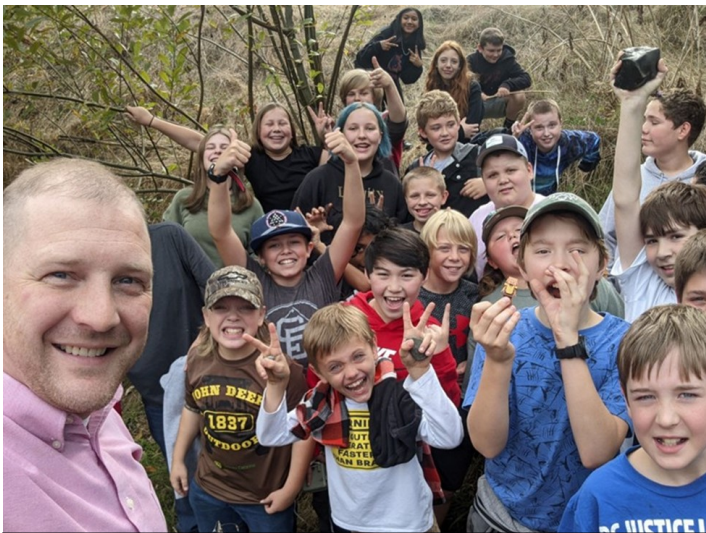
Talmage Middle School Students – all smiles for being in the creek.