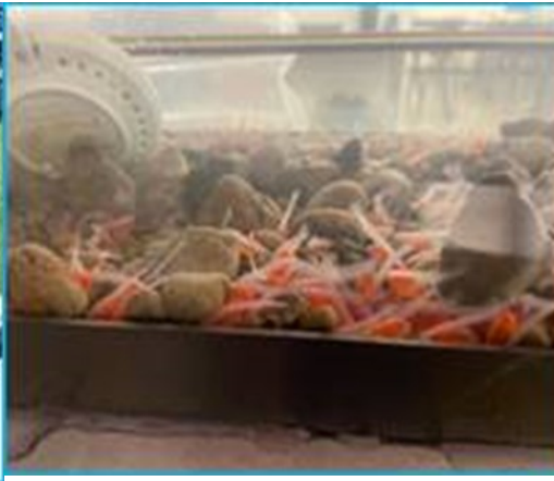
Blue Mountains Fisheries/ Watershed Educational Pro- gram