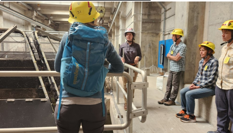
Becca C. of the Army Corps of Engineers explains how adult salmon are collected and processed in the CRITFC Adult Fish Facility.