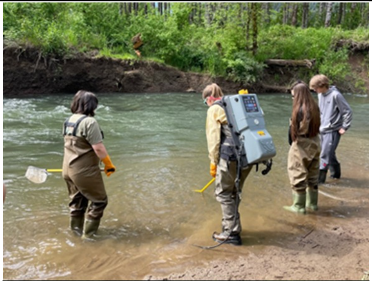
Marys River Watershed Council Educators Grant 2022. Philomath High School Students Efishing for lamprey.