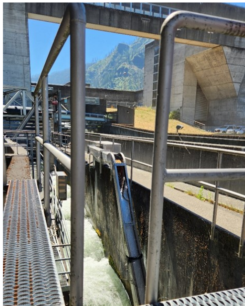
An adult lamprey works its way up the Lamprey Passage Structure on the Washington side fish ladder.