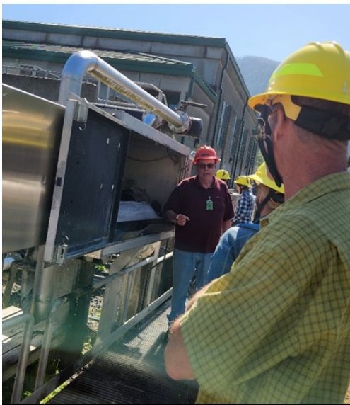
Dean B. of the Pacific States Marine Fisheries Commission demonstrating how a subsample of fish is collected every ten minutes and brought into the Smolt Monitoring Facility for sampling.