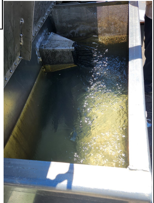
Adult lamprey that climb the Lamprey Passage Structure end up in this collection box, where CRITFC staff collect them and transport them to holding tanks at Bonneville Fish Hatchery.