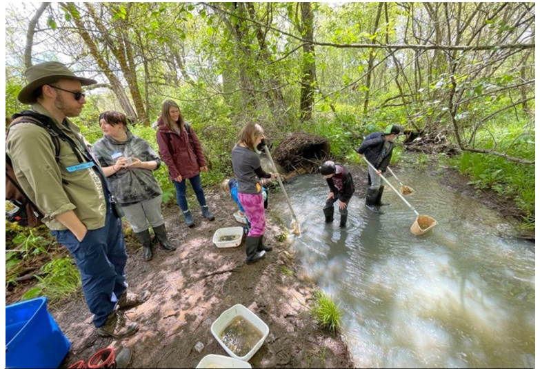
Corvallis 3rd graders sampling for macroinvertebrates.