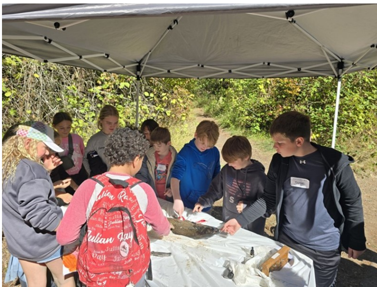
The South Santiam Watershed Council was a recipient of an Educators Grant this last cycle, and they used the funds to help set up a Salmon Dissection station at a local outdoor education event.