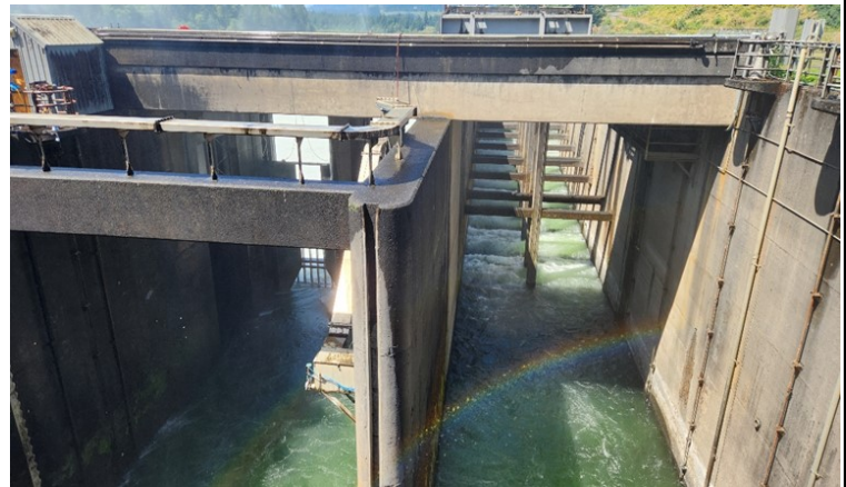
The entrance to the Washington fish ladder. Large grates are installed at the entrance to exclude sea lions from entering the fish ladder.