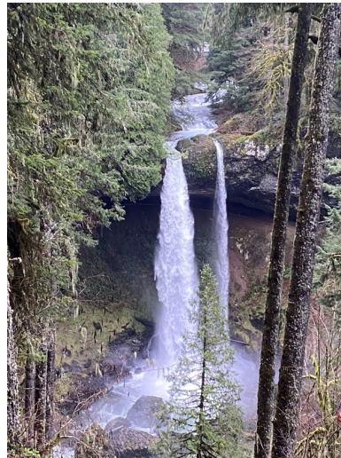
First Day Hike at Silver Falls State Park 1.1.2025

When I am talking with colleagues, a constant theme that people are struggling with right now is a lack of adequate budgets and increasing workload capacities. We are a non-profit, volunteer-run, volunteer-lead organization and we depend on the enthusiasm, intention, and commitment of all of you to help spearhead and execute our mission. We are an award-winning Chapter with a long history of excellence that was built on the passionate volunteer efforts of our membership and supporters. And when it comes time to recruit help for the next ExCom or to populate our committees, we often struggle to find people willing to commit any of their limited time. There are numerous opportunities to get involved, be it running for a position on the Executive Committee or one of our many teams within the external and internal committee structures. We are striving to keep the workload reasonable while still implementing our mission and endeavoring to be a leader in the AFS organization. This can only happen with a whole team of volunteers, all working together. If you've got a vision for Oregon AFS's future, or can spare just a little time to help, come join the team!