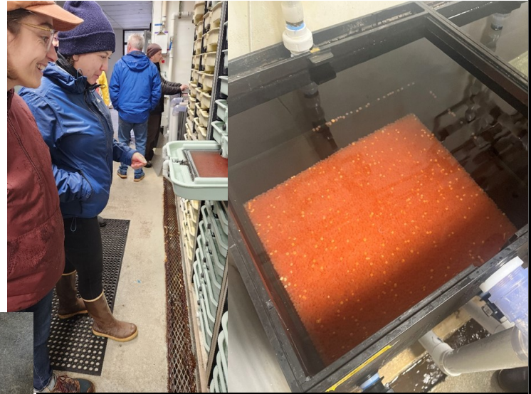
(Left) Attendees observe eggs being incubated in Heath Stacks. This method allows for eggs to be separated into small groups (5000-8000) while still incubating a large number of eggs with a small amount of water. (Right) Eggs being incubated in a bulk incubator. This method allows for a large number of eggs to be incubated without being separated.

The field trip was to observe Coho spawning at Sandy Hatchery, including the gamete removal from both males and females, fertilization, putting the eggs down for development, and data collection, and to observe rearing juveniles and the adults returning to Eagle Creek National Fish Hatchery. Fifteen people from various agencies and specialties attended.