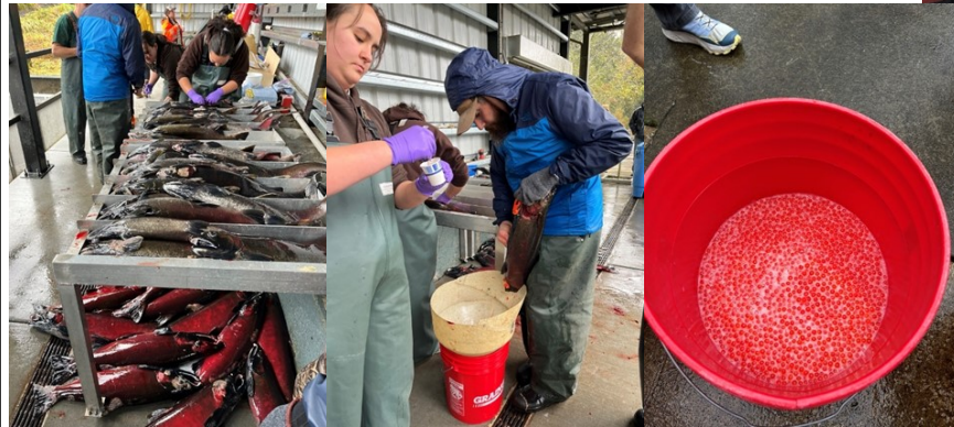
(Left) Female coho laid out on the rack and males under the rack waiting to be spawned. (Middle) A pathologist collecting ovarian fluid from a female to test for viruses. (Right) A bucket of eggs after addition of milt, during fertilization.

juveniles that will be released in spring of 2025 rearing in raceways. He discussed how the facility supports the US Government's commitments to tribal fisheries by rearing fish for release by tribes, and as a back up source of eggs. He also talked about the challenges associated with those tasks and funding that supports those processes.