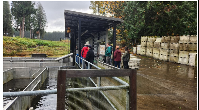
Attendees arrive at the Sandy Hatchery spawning shed.

At Eagle Creek National Fish Hatchery, the hatchery manager walked the attendees through collection of adults, through their egg incubation, and showed the