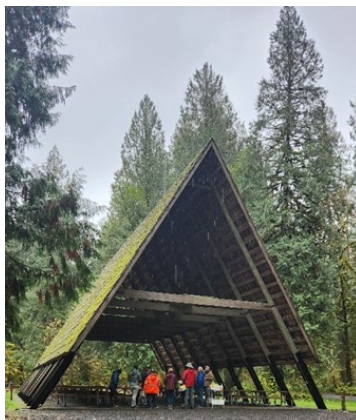
The picnic shelter at Eagle Fern Park. Attendees are talking with the ODFW District Biologist and other area staff.

On the way to Eagle Creek National Fish Hatchery there was a lunch stop at Eagle Fern Park. There attendees were able to ask the ODFW District Biologist questions about the program, and learned about the challenges fish face as they navigate the dams on the system, and about habitat improvements that have happened in the Clackamas basin over the last few years.