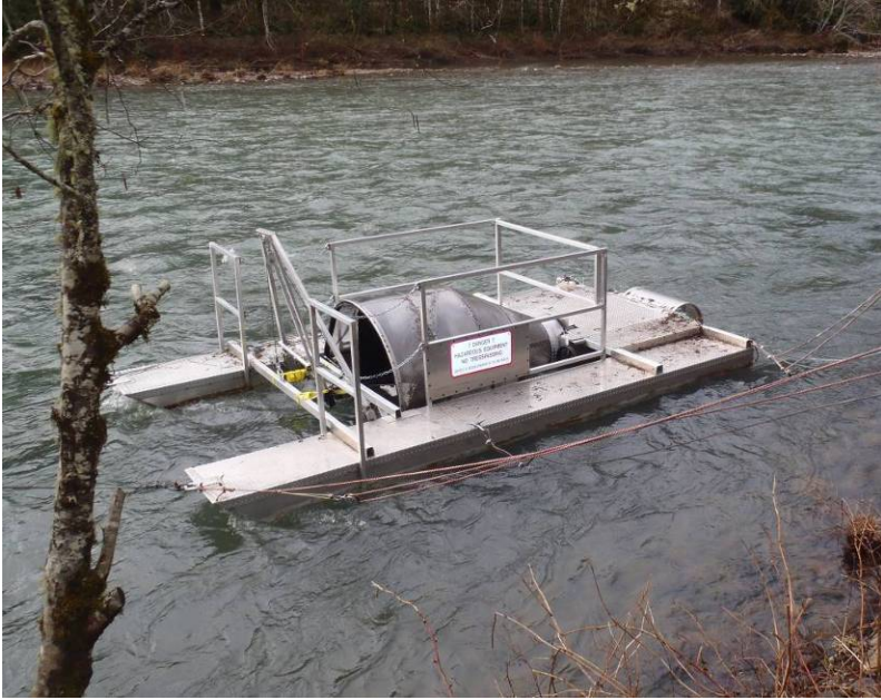
Photo showing proper hand rails. Note metal plate at pinch point on port side and proper signage. All required.